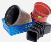
Plastic containers & plant-pots