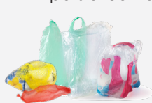
Plastic sachets, bags and clingfilm