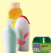
Beauty and hygiene product packaging