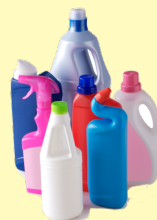
Cleaning product packaging