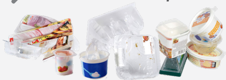
'Lightweight' plastic boxes, pots & containers